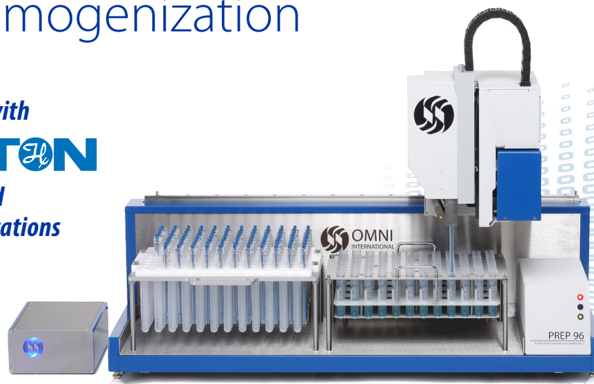
Omni Prep 96 Automated Sample Prep Homogenizer Workstation

Compatible with HAMILTON Star Liquid Handling Workstations