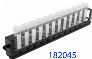
14/15 mL Conical Tubes