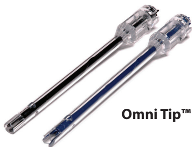
Omni Tip™ Plastic Probes