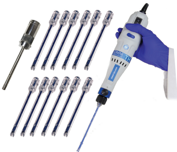
Omni Tip Kit with 7 mm Stainless Steel Generator Probe

Omni's convenient Tissue Homogenizing Kits come with everything needed to homogenize tissue samples quickly and efficiently for successful RNA extraction. Each kit includes an Omni TH Homogenizer with an adapter for mounting Omni Tips™ generator probes (see Omni Tip™ Plastic Probes Section for more information). A choice of stainless steel rotor-stator generator probes is also available (see Motor Maintenance Section for more information). Omni's Tissue Homogenizing Kits are designed for situations where molecular contamination between samples cannot be tolerated. Stainless steel generator probes are available for efficient processing of frozen and/or fibrous tissues. Omni Tips™ are ideal when molecular contamination is of the utmost concern and are most beneficial when working with soft, unfrozen tissues. It is important that the diameter and length of the selected generator probe will fit securely within the vessel being used and the generator probe (plastic or stainless steel) is appropriate for the application.