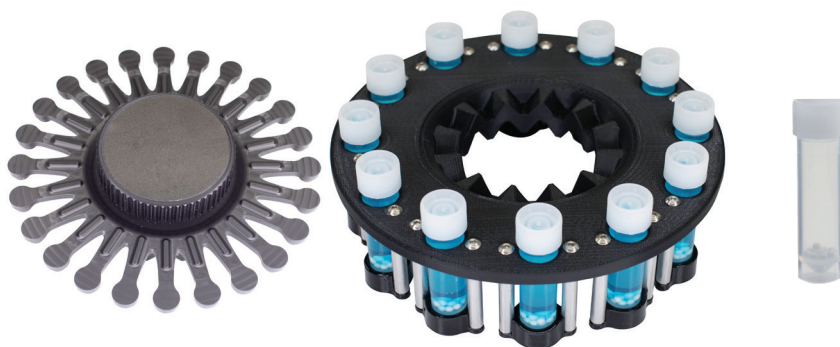
Finger Plate & 7 mL Tube Carriage