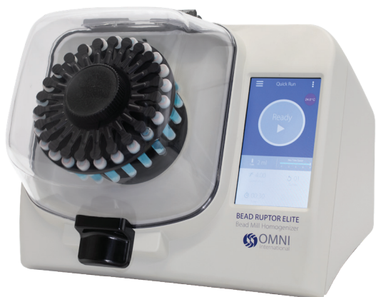
Bead Ruptor Elite™ Bead Mill Homogenizer