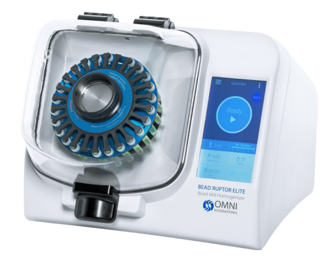
Bead Ruptor Elite (Catalog Number 19-040E)

Desired End Result: Complete Homogenization of soft and tough plant samples