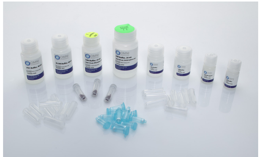
Soil DNA Purification Mini Kit