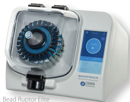
Bead Ruptor Elite