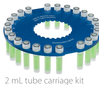
2 mL tube carriage kit